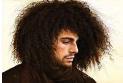
SIXTEEN LIVES IN THE WIND (2016)