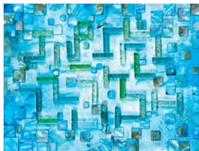
THE GAME (2021)