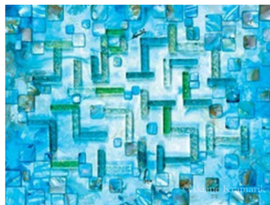
THE GAME (2021)