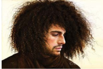
SIXTEEN LIVES IN THE WIND (2016)