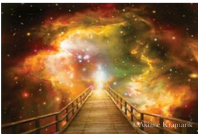
THE LIGHT (2018)