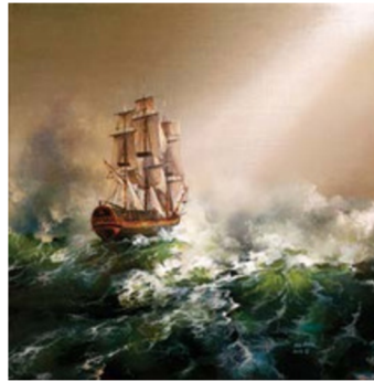
DIVINE COMPASS (2018)