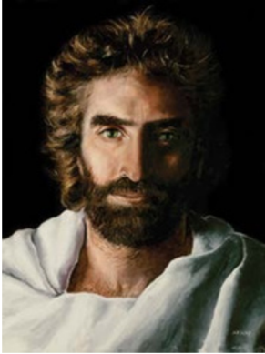
PRINCE OF PEACE (2003)